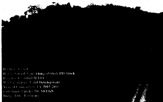
Image : Organic cultivation of crops in the Gram Panchayat