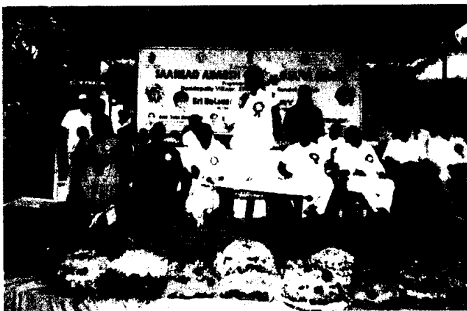
Image : Hon'ble MP participating in the groundbreaking ceremony